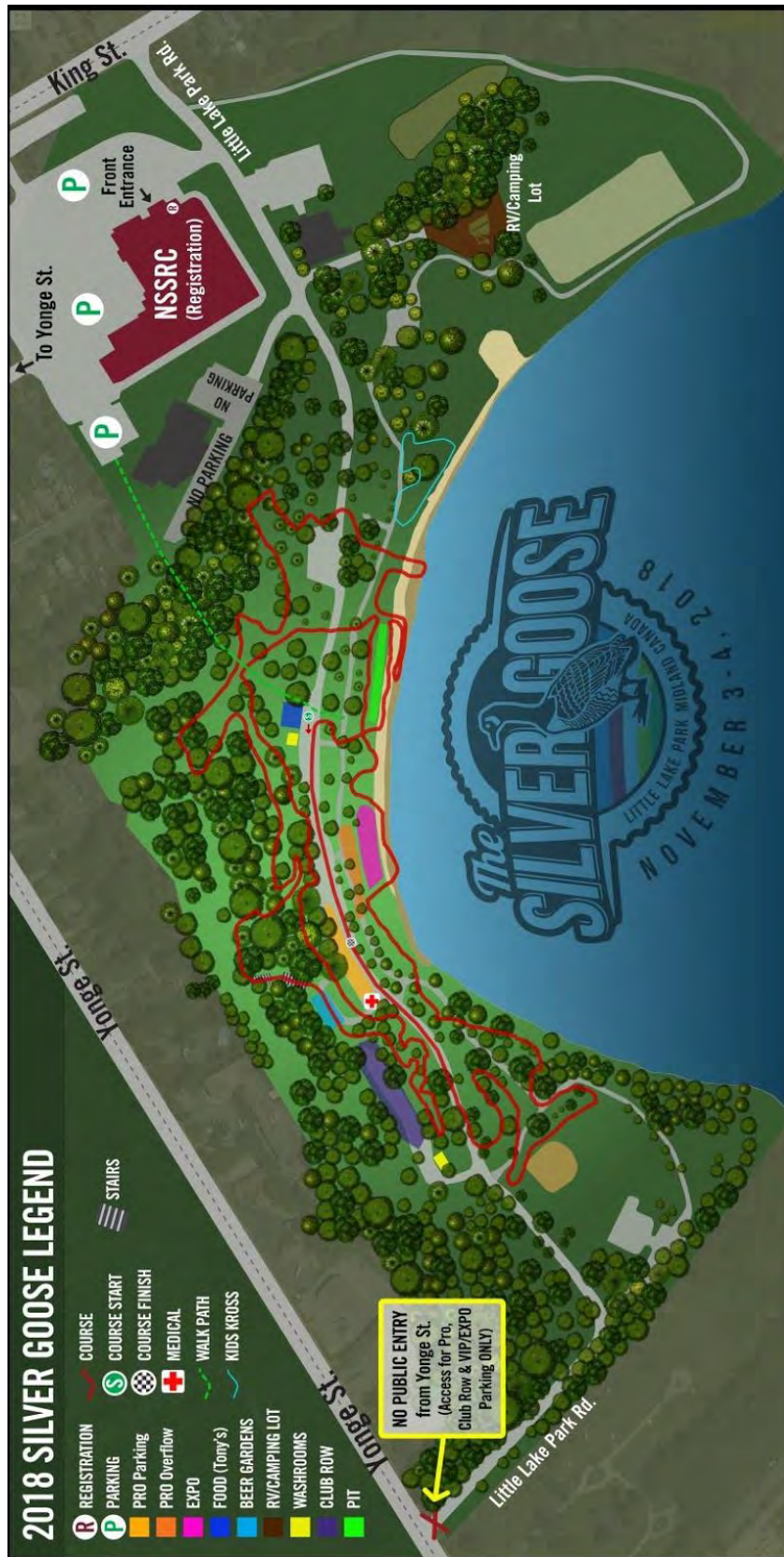
(2018 version shown - pending 2019 updates shortly)